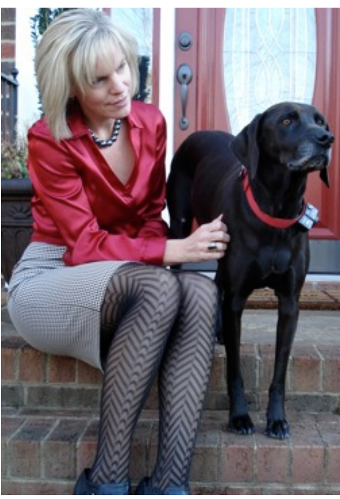
Boy, I do LOVE this skirt!!!