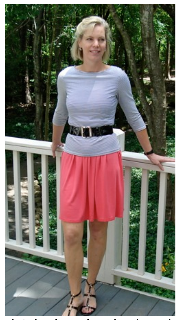
Striped 3/4 sleeve boat-neck stretch top (Express brand) I purchased this on a 'special sale' day for only $.99!

I was visiting Marla (FlyLady) in Brevard North Carolina and on my way to my favorite coffee shop Quotations, I stopped in at the Safe Attic (a thrift store that benefits victims of domestic abuse) just to 'scout things out'....Bargains galore!