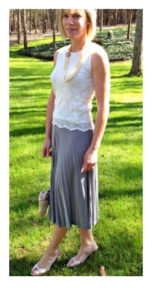
See more on my MSP Style Blog: <a href="http://missussmartypants.blogspot.com/2012/03/doing-more-than-just-pinning-on.html">http://missussmartypants.blogspot.com/2012/03/doing-more-than-just-pinning-on.html</a>

NEED MORE CREATIVE WARDROBE IDEAS THAT ARE CHEAP TO DO??? Check out my own DIY Pinterest board: <a href="http://pinterest.com/missusmsp1/diy-stuff-i-want-to-try-do/">http://pinterest.com/missusmsp1/diy-stuff-i-want-to-try-do/</a>